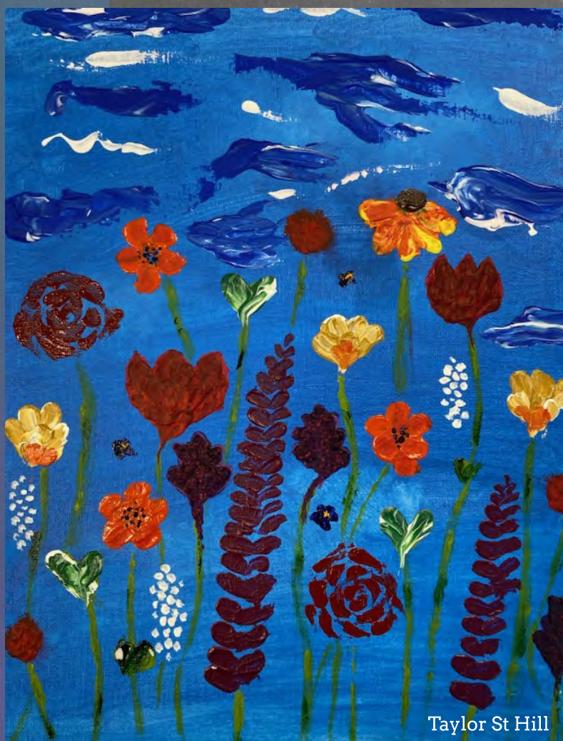
Taylor St Hill

In this year's edition includes exceptional sketches and